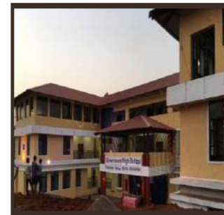
Government School Surla