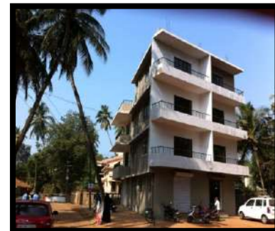
Paris Apartments Taleigao