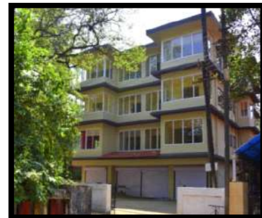
Casa Bondir St. Cruz