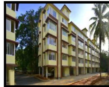
Orchard Avenue, Phase - I Merces