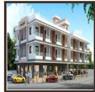
Estrada Royale Kadamba Plateau