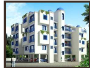
Priority Eros Porvorim