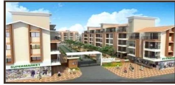
Orchard Avenue, Phase - III Merces