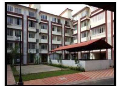
Orchard Avenue, Phase - II Merces